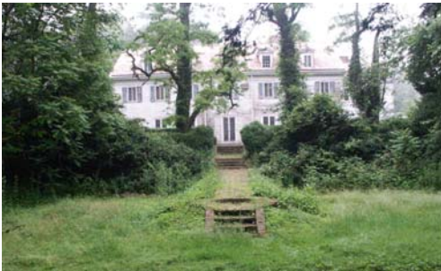
South façade from Sunken Garden, 2009