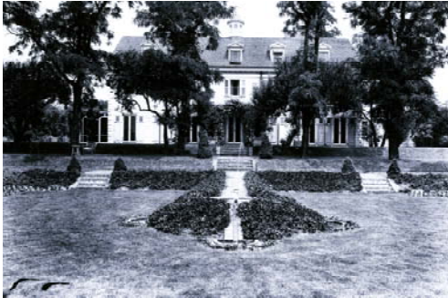
South façade from Sunken Garden, 1914.

Date: 2009-2010 Context: North shore of Long Island, Syosset, NY