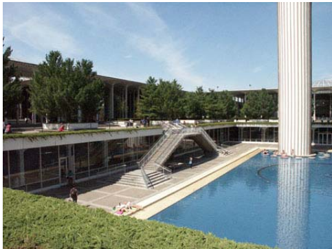
Images around campus, Spring 2008