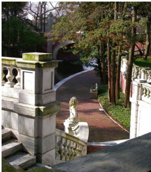
The Sunken Garden and Lagoon

The project's major objectives included the preparation of an Existing Conditions Assessment for the Historic Campus Core. Our team of consultants analyzed the building envelopes for maintaining original historic fabric, developed a restoration methodology for the character-defining landscape features, and developed a comprehensive master plan that balances history, use, and maintainability while framing a vision for the future for the historic campus core. The final Plan will assist the University in making informed capital expenditures and act as a road map for future preservation, conservation, restoration, and rehabilitation work on the buildings and site. All of our work followed the guidelines established by The Secretary of the Interior's Standards and Treatments of Historic Properties prepared by the National Park Service, 1996.