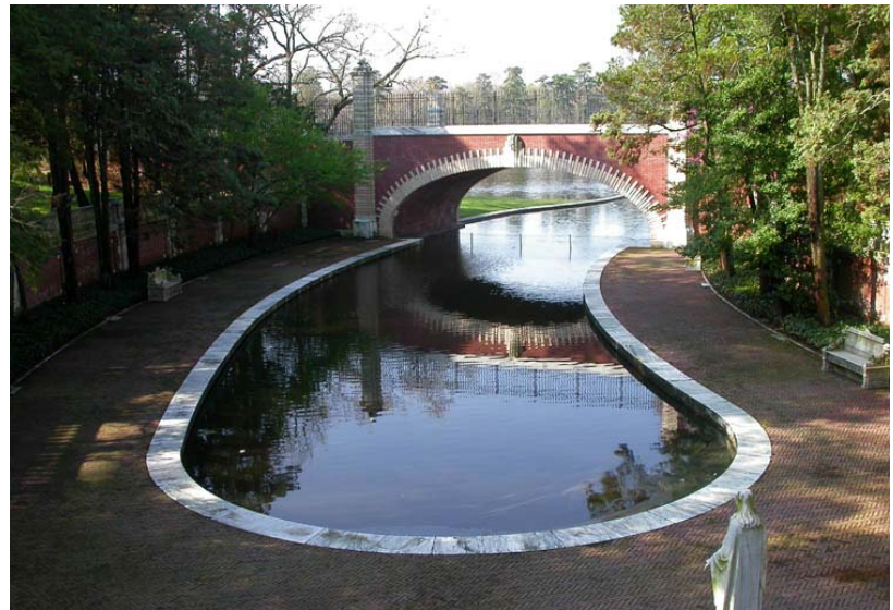
The Lagoon from within the Sunken Garden