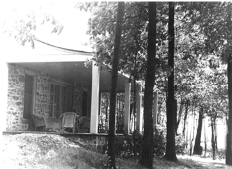
West facing porch at Top Cottage

Elmore Design Collaborative, Inc. consulted with the Franklin and Eleanor Roosevelt Institute, members of the National Park Service and John G Waite Associates, the architectural firm restoring the cottage, to research FDR's western viewshed. Historical photographs, historical aerial photographs and USGS quadrangle maps were used to establish the extent of FDR's scenic views to the west. Work included archival research to identify period photographs and maps, site assessment, the preparation of a site plan and cross-section of the viewshed area, support in preparing the recommendations to guide the lumberman's sensitive tree removal and periodic site observations. By late summer of 2001, the western views were restored.