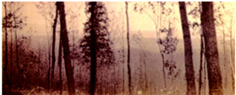
Circa 1938-39