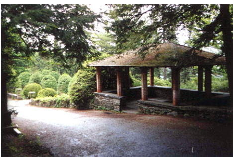
Existing condition photographs - 2001